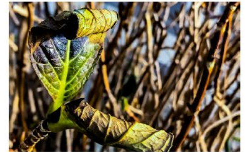
Dead or discolored vegetation