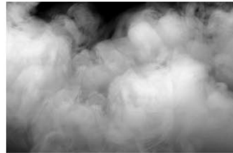
A dense white cloud or fog