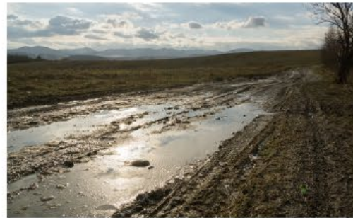
A pool of liquid on the ground