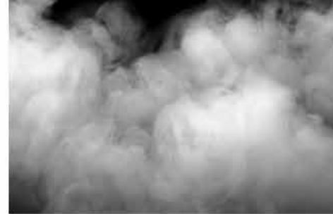
A dense white cloud or fog