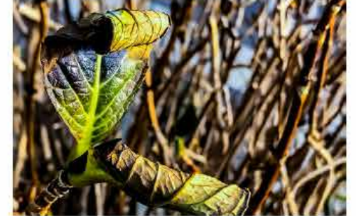
Dead or discolored vegetation