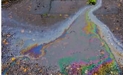
A rainbow sheen on water