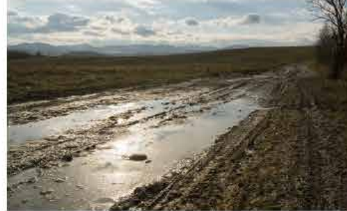
A pool of liquid on the ground