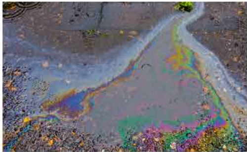
A rainbow sheen on water