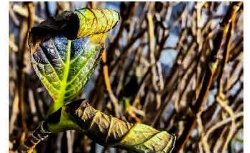
Dead or discolored vegetation