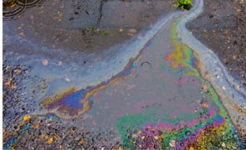
A rainbow sheen on water