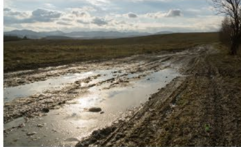
A pool of liquid on the ground