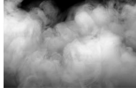
A dense white cloud or fog