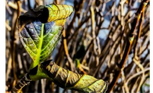
Dead or discolored vegetation