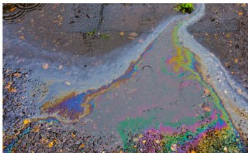
A rainbow sheen on water