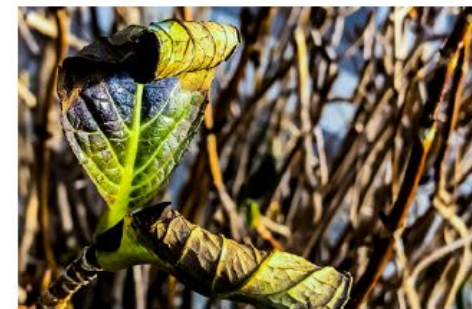
Dead or discolored vegetation