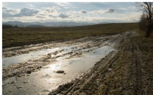
A pool of liquid on the ground