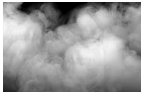
A dense white cloud or fog